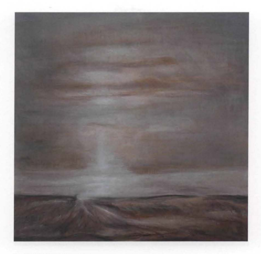
UNTITLED, OIL ON CANVAS, 48 X 48 INCHES

"I WAS NOT THINKING OF ANYTHING BUT A SPIRITUAL CONNECTION WHEN PAINTING, BUT IN THE END THEY REMIND ME OF FAMILY AND TIMES AT THE RANCH IN SOUTH TEXAS."