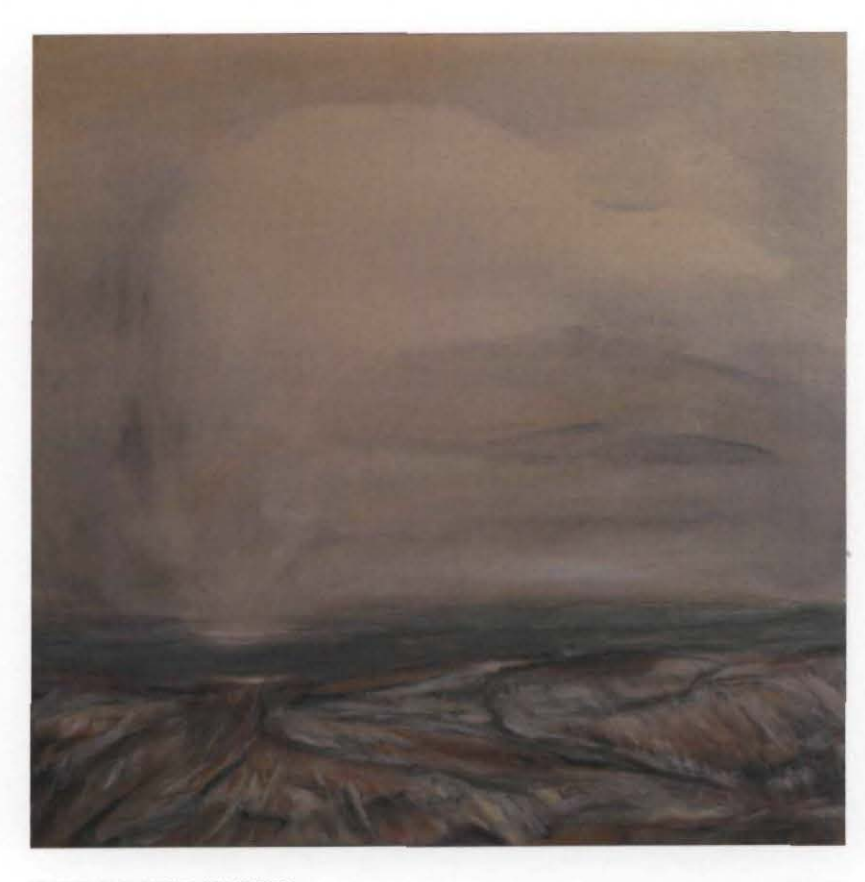
UNTITLED, OIL ON CANVAS, 48 X 48 INCHES