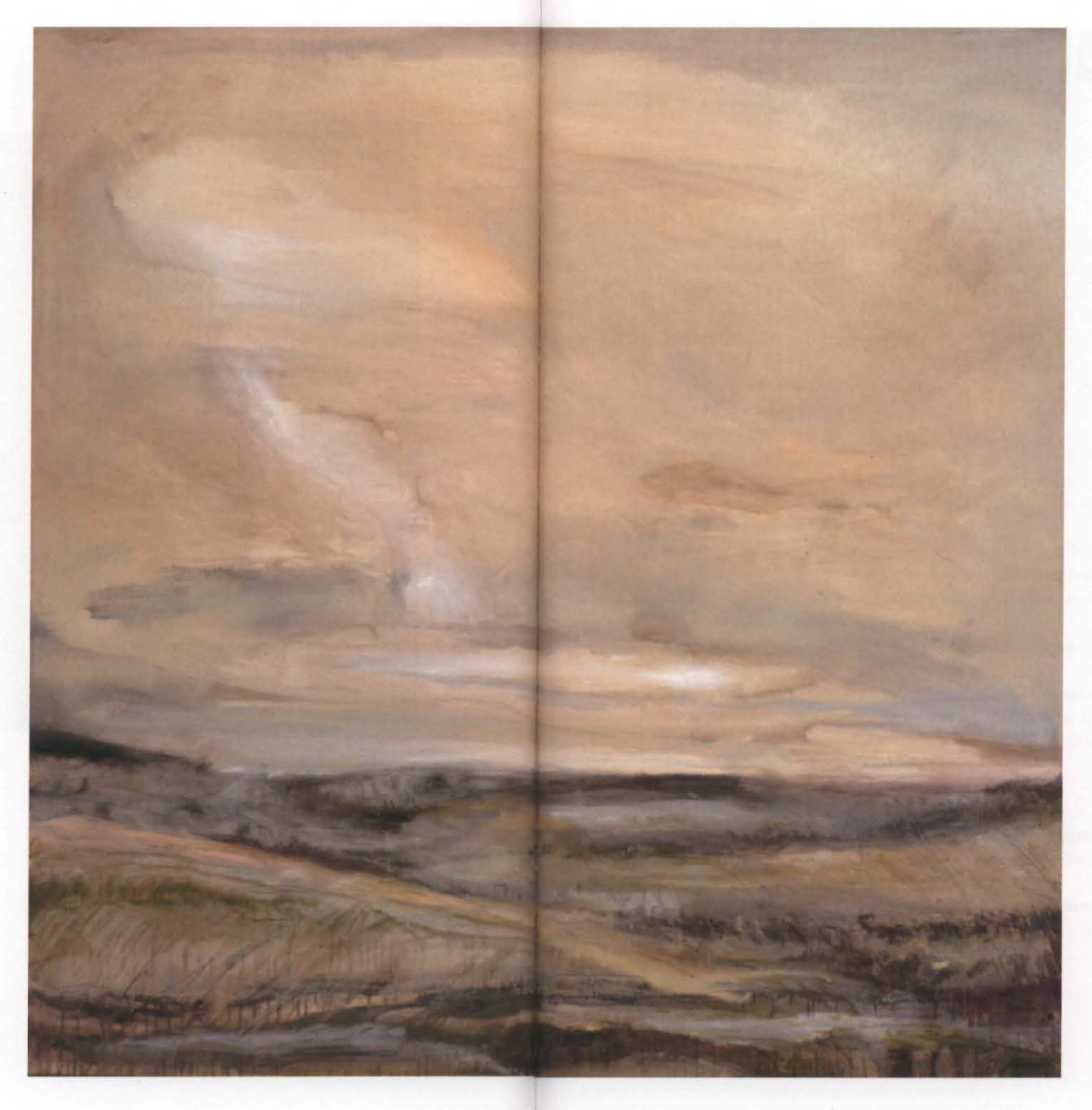
UNTITLED, OIL ON CANVAS, 48 X 48 INCHES