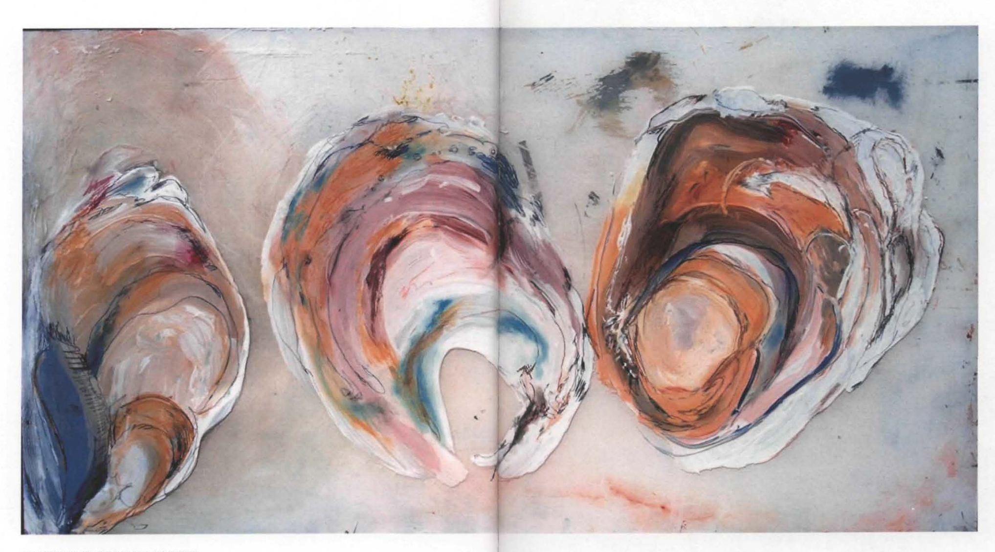
WOMB SERIES #7. ACRYLIC ON PLEXIGLAS, 48 X 38 INCHES