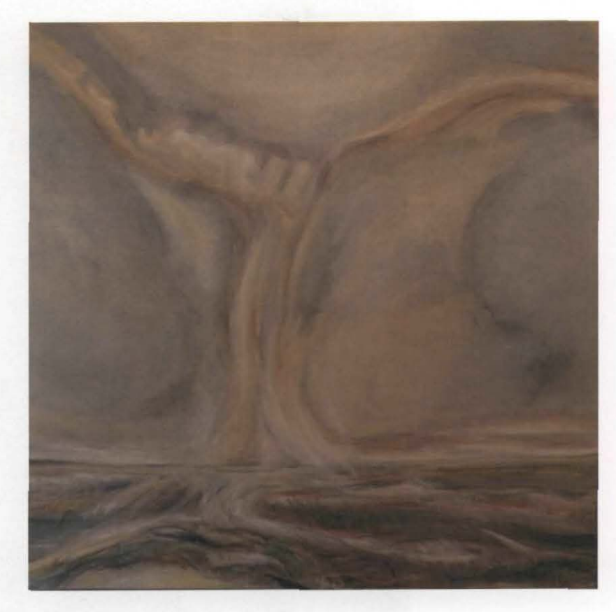
UNTITLED, OIL ON CANVAS, 48 X 48 INCHES