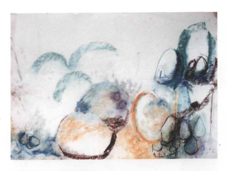
WOMB SERIES #4, PASTEL ON PAPER, 36 X 24 INCHES