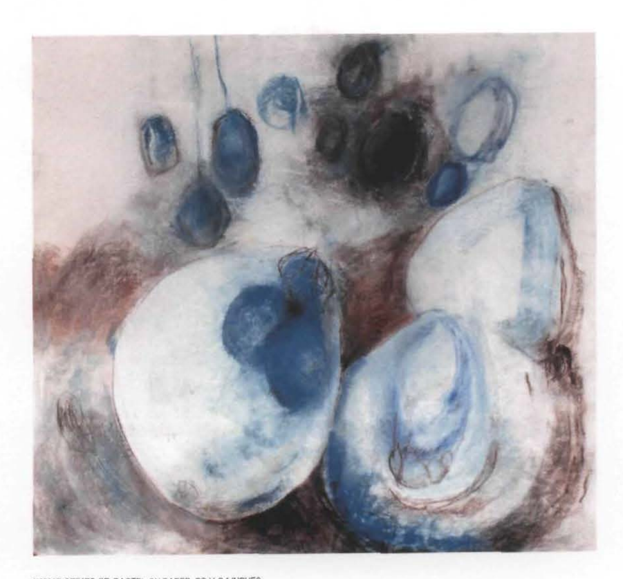
WOMB SERIES #5. PASTEL ON PAPER, 36 X 24 INCHES